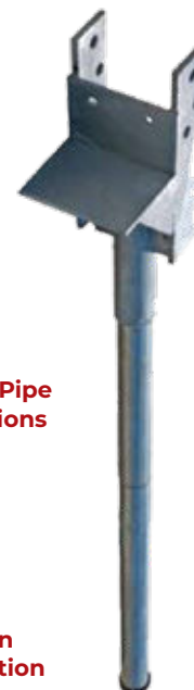
Pier Pipe Sections