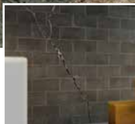
Cracked Foundation Walls