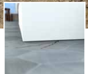
Cracked & Sagging Floors