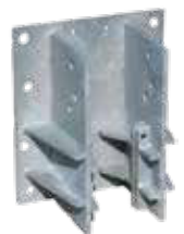
Optional Wall Plate Bracket