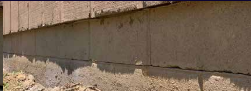
After: Gap Closed

Life happens in your home. We believe you and your home deserve the best. Grounded in our commitment to faith and family first, our trusted team has been caring for homes just like yours since 1987. We offer effective and permanent waterproofing and foundation repair solutions that will withstand the life of your home; this is our Helitech Promise.