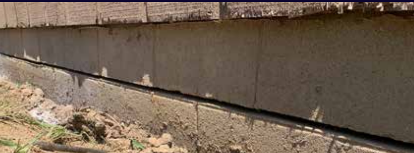
Before: Gap allowing moisture and pest intrusion.

Helitech's Resistance Pier System provides a smart, cost-effective solution for sinking foundations.