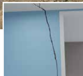
Cracked Interior Walls