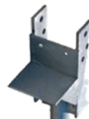
UNDER FOOTING BRACKET