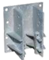
OPTIONAL WALL PLATE BRACKET